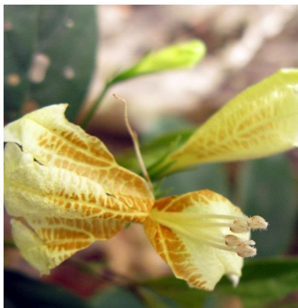
Fig. 2: Yellow flower rock flower structure

The order by quantity is as follows: Cop3, Cop2, Cop1, Sp, Sol, Un