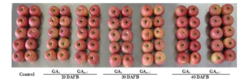
Fig. 1: Effect of GA<sub>3</sub> and GA<sub>4+7</sub> paste treatment on fruit size and skin color of 'Fuji' apple at harvest (November 5, 2012). DAFB indicated days after full bloom.GA<sub>3</sub> and GA<sub>4+7</sub> indicated 2.7% GA<sub>3</sub> and 1.2% GA<sub>4+7</sub> paste treatment, respectively

<sup>2</sup>DAFB: days after full bloom. <sup>3</sup>Different letters within the same column represent a significant difference based on the Tukey-Kramer's HSD test at the 5% probability level (n = 50). <sup>3</sup>NS, *, and ** indicate non-significant and significant differences at the 5% and 1% probability levels, respectively, according to the two-way ANOVA