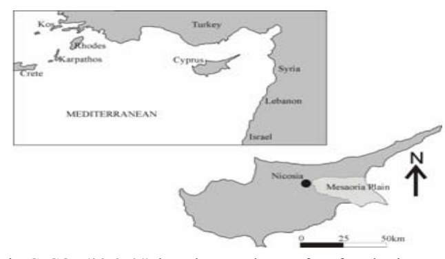
Fig. 1: Location of the study site

in CaCO<sub>3</sub> (23-27%) based on analyses of surface horizons, whereas other series showed low CaCO<sub>3</sub> (1-5%). The soil OM content in the surface horizons varied from 1.2% in the Doğancı series to 3.0% in the Zümrütköy soils. The distribution of OM showed a typical decrease with increasing depth (Table I). The cation exchange capacity (CEC) of soils is determined up to 52 cmol kg<sup>-1</sup> but varies were between 25 and 40 cmol kg<sup>-1</sup> due to clayey texture, which ranged between 27% (Zümrütköy) and 40% (Mormenekşe).