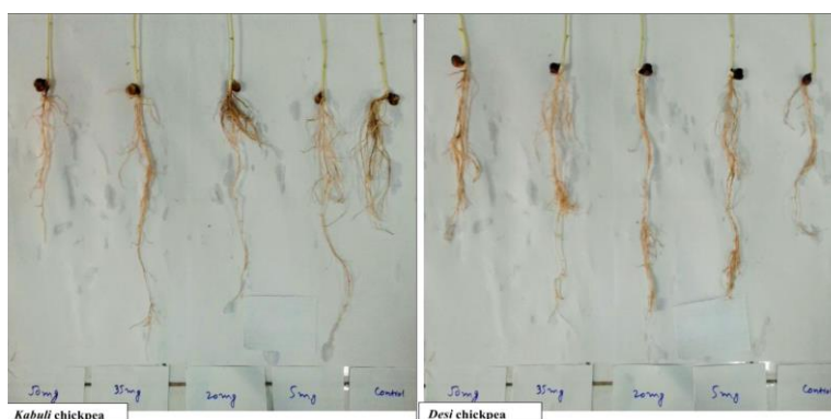
Fig. 1: Influence of different Zn seed coating concentrations (5, 20, 35 and 50 mg kg -1 seed) on the seedling root growth of chickpea types ( kabuli and desi ) in sand filled pots

** = Significant at p \leq 0.01 ; * = Significant at p \leq 0.05