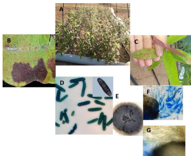
Fig. 1: (A) Clonal mini-garden of the "canaletão" type. (B) Leaf spots on the mini-stumps of Corymbia torelliana × C. citriodora . (C) Approximate image of lesions observed in the mini-stumps of Corymbia torelliana × C. citriodora . (D) Conidia of Stigmina eucalypti . (E) Sulcosporium thailandica colony grown in BDA medium. (F) Bitunicate asci and (G) fusiform ascospores