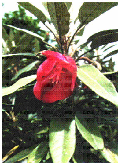
Fig. 1. Trochetia boutoniana flower

When the Porebski et al. (1997) extraction protocol was used the DNA yield was reduced to 306.2 \mu g per gram of leaf material. The purity on the other hand improved ( A_{260/280} and A_{260/230} ratios of 1.257 and 1.640, respectively) and the bands following electrophoresis were sharper. Several modifications were made to the Porebski et al. (1997) protocol. Use of 0.5% \beta - mercaptoethanol, 1.6 M NaCl and 2.5% PVP (Mr 10000) were found to be most appropriate. Although the yield of the DNA was further reduced to 283.5 \mu g per gram of leaf material, the A_{260/280}