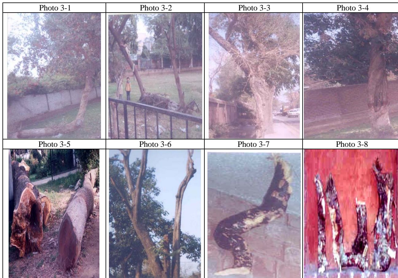
Photo 3. Modes of ENOs Entry into the Plant