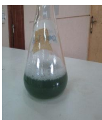
a. Pseudomonas spp