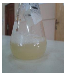
b. Bacillus spp