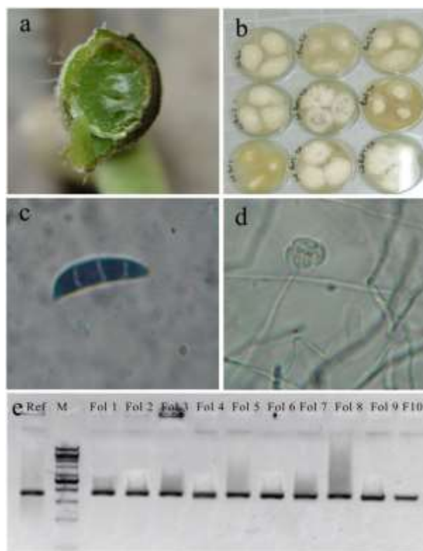
Fig. 1: Isolation and identification of Fol isolates. (a) Infected tomato stem showing vascular browning. (b) Culture purification of Fol isolates. (c) Macroconidia of Fol. (d) Microconidia production by Fol. (e) molecular identification of Fol by species specific primer

Pathogenicity test of the different isolates for the isolated fungus was carried out under green-house conditions.