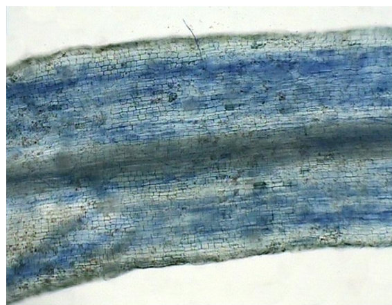
Fig. 1: Root colonization of trifoliate orange [ P. trifoliata (L.) Raf.] by Funneliformis mosseae (Wu QS, unpublished data). Blue zones mean mycorrhizal infection in the roots

Mycorrhization has been observed to induce 19–26% higher EE-GRSP and 13–20% higher T-GRSP in the mycorrhizosphere than in non-mycorrhizosphere following the inoculation with AMF (Wu et al. , 2014b), implying that AMF inoculation could help in production of endogenous GRSP fractions for further utilization. Significantly higher EE-GRSP, DE-GRSP and T-GRSP induced by mycorrhization was absolutely dependent on AMF genotype since hyphal diameter, hyphal wall thickness, and its branching pattern collectively influenced the production of GRSP (Wang et al. , 2014). In addition, soil management