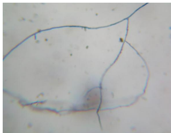
Fig. 2: Extraradical mycorrhizal mycelium from the roots of trifoliate orange [ P. trifoliata (L.) Raf.] colonized by F. mosseae (Wu QS, unpublished data). These mycelium into soils are considered as soil hyphae

strongly affected GRSP levels in fruit orchards. In 13–15-year-old Newhall navel orange trees (grafted on trifoliate orange) located at Three Gorges Region (China), the highest T-GRSP content was detected in no-tillage and sod culture soil and the lowest in clean-tillage soil management (Wang et al. , 2011). On the other hand, infection with Funneliformis mosseae showed an increase in production of EE-GRSP, DE-GRSP and T-GRSP in trifoliate orange seedlings, irrespective of substrate P level (Wu et al. , 2015a).