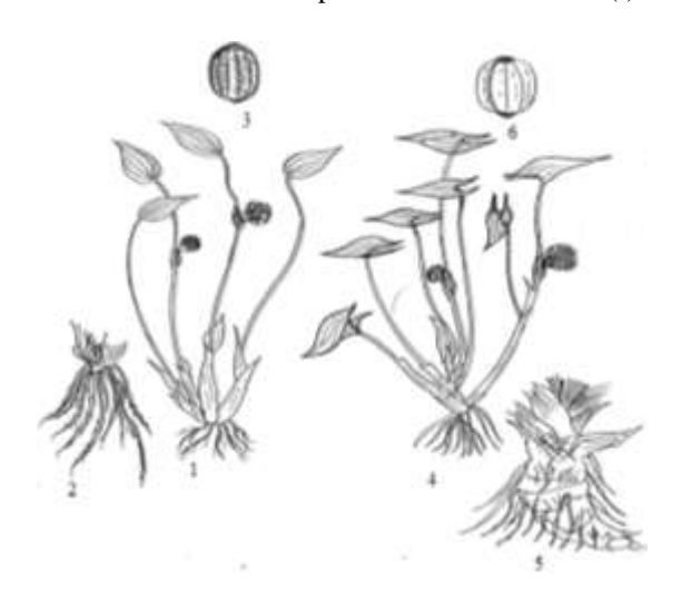
Fig. 2: 1-3, Monochoria vaginalis 1- flowering plant, 2 - unbranched rhizome, 3- seed; 4-6, Monochoria hastata . 4 - flowering plant, 5-branched rhizome, 6 - seed