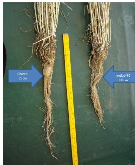
Fig 3: Comparison of root length for Dharabi-11