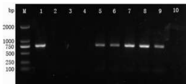
Fig. 2: PCR analysis of T 0 transgenic Chinese cabbage plants. Primer 1 was used for identification of the aiiA gene. PCR products were 753 bp in length. Lane M: DL2000 Marker; Lane 1: aiiA ; Lane 5, 6, 7, 8, 9: PCR-positive result; Lane 2, 3, 4: PCR-negative result; Lane 10: untransformed controls