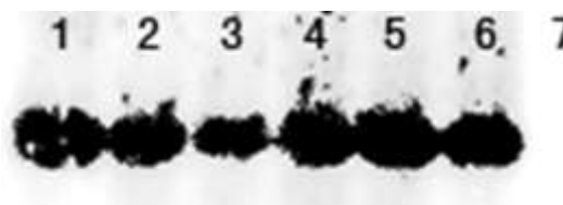
Fig. 3: PCR-southern blot analysis of T 0 transgenic Chinese cabbage plants. Lane 1: aiiA ; Lane 2-6: transformed plant; Lane 7: untransformed controls